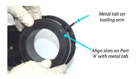
Figure 3 - Align slots on part A with welded tab on trailing arm