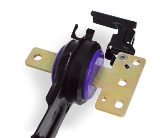
Figure 4 - fitted image of PFR19-1917