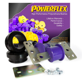
Figure 1 - Retain small metal bracket from original bush for refitting to new bush